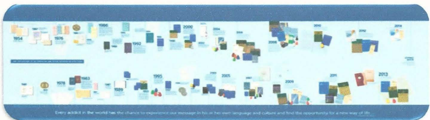
NA Literature Timeline

Considering the events recounted above, it seems quite clear that the NA Fellowship has expressed its conscience on the matter of its recovery literature. Any efforts by individuals or groups to reprint altered NA literature do not reflect the conscience of the NA Fellowship. The NA groups, as owners of NA’s copyrights, and NA World Services, as trustees in the Fellowship Intellectual Property Trust, are partners in the effort to protect NA’s copyrights. We are asking that you embrace this partnership and remember that NA groups and members have the right and the responsibility to demand that those who would reprint or modify NA literature refrain from doing so. Personal recovery depends on NA unity; we must work together to safeguard the integrity of our life-saving literature.