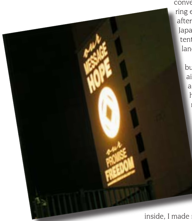
WCNA-32 theme projected on a building, just outside of Sunset Station, the site of the convention kick-off festival.

My volunteer shift in merchandise didn't start until 7:00 pm, so I had time to socialize, find a sponsee, meet more people, and collect more hugs. The energy of recovery carried me through a blur of workshops, volunteer commitments, step work with sponsees, comedy shows, and speaker meetings. My time as a cashier in merchandise allowed me to hug addicts from Bahrain, Kuwait, Brazil, Colombia, Canada, and Japan, as