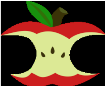
"Core Issues Vol. 1 issue 3"