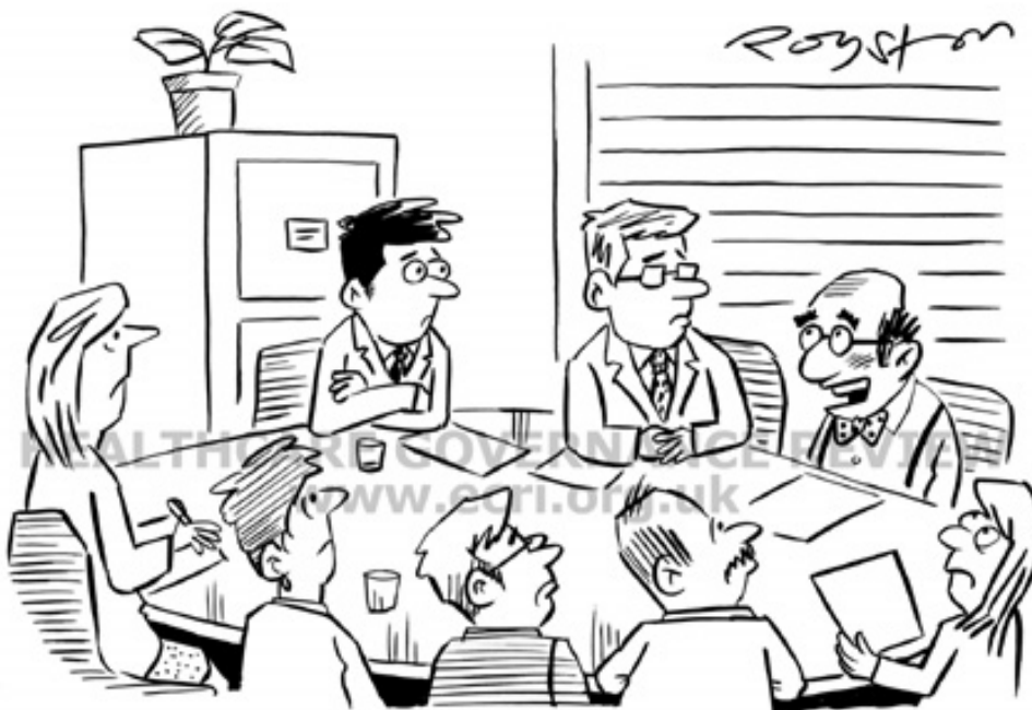
“I did put together a questionnaire to assess board effectiveness, but I’m afraid I left it on the train.”