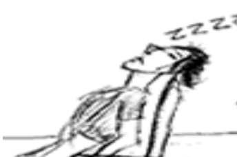
Meetings Life Story