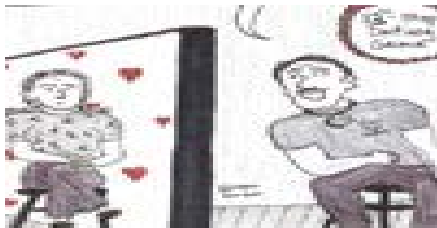
13step dating Game