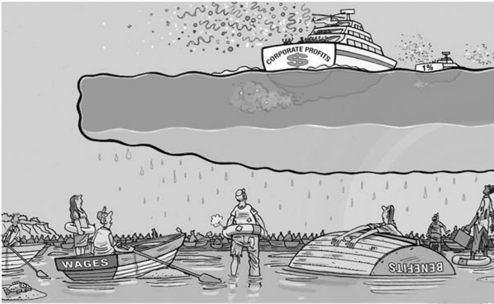
“A RISING TIDE LIFTS SOME BOATS...”