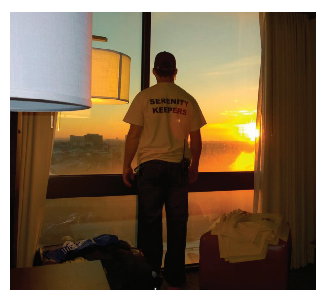
First Esperanza Convention; San Antonio, Texas

Email your entry with "Basic Caption Contest" in the subject line, and be sure to include your name and where you're from in the body of the email: <u>naway@na.org</u>.